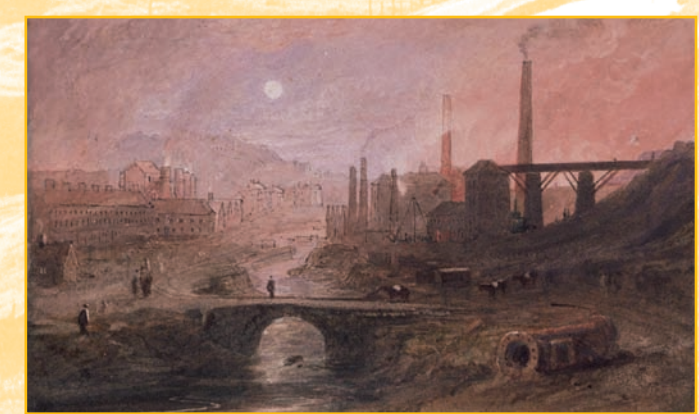
Nantyglo Ironworks, 1829

This was another part of Baileys Llangattock Tramroad and ran to the older part of the Nantyglo Ironworks on the east bank of the Ebbw Fach.