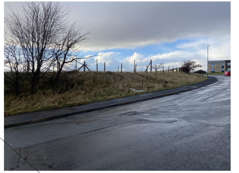
Chartist Way to Dukestown Road