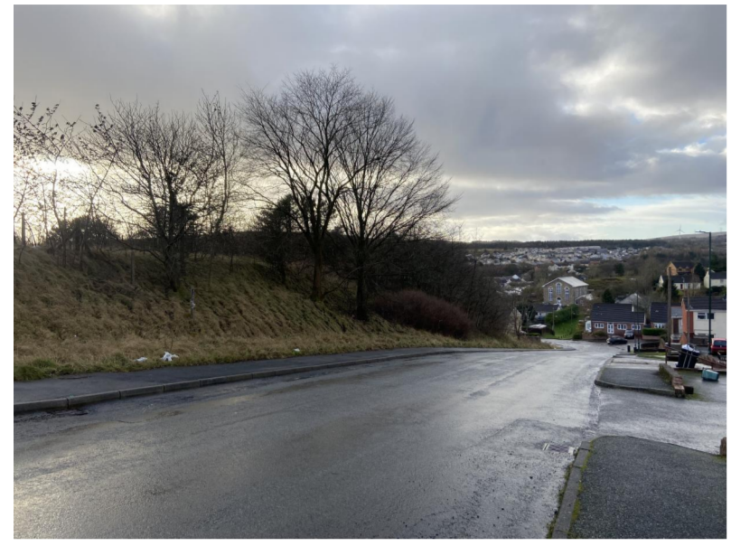
Chartist Way to Dukestown Road Junction