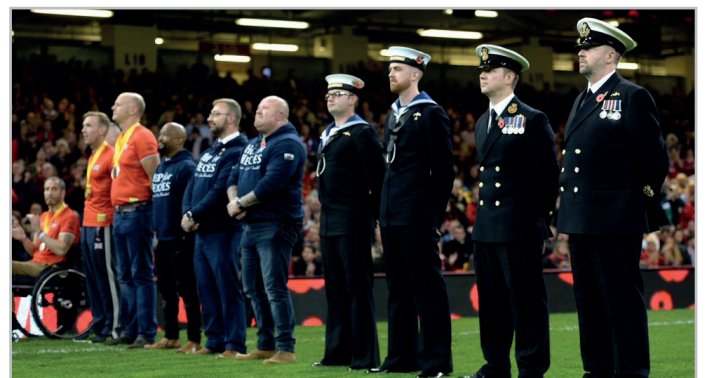
Help for Heroes Band of Brothers Fellowship members join serving personnel and Invictus athletes to commemorate 100 years since the end of World War I at the Principality Stadium.

For more information about support in Wales visit: www.helpforheroes.org.uk/get-support/how-to-access-our-services/recovery-in-wales/ Call: 01443 808910 email: wales.supporthub@helpforheroes.org.uk