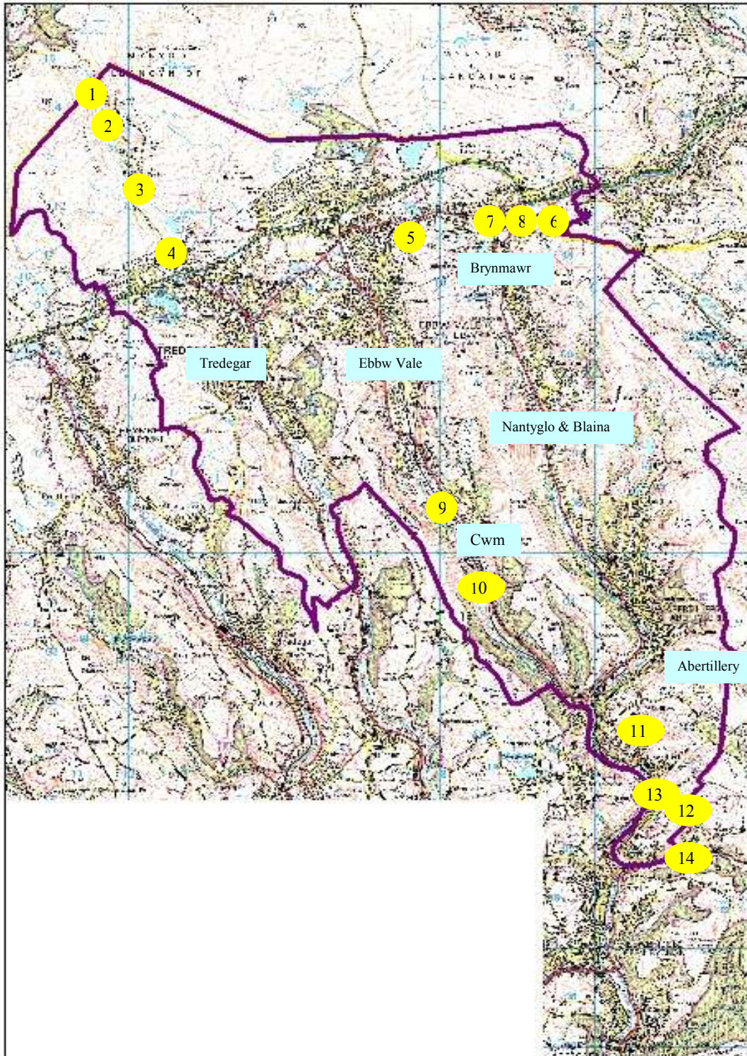
Location map of all NOx Tubes