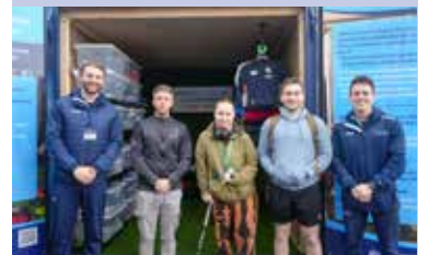
Third community kit room opens see page 6