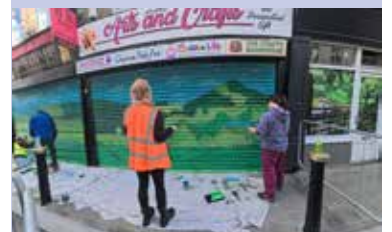
Abertillery town boost makeover see page 7