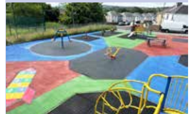
Play areas to be refurbished see page 4