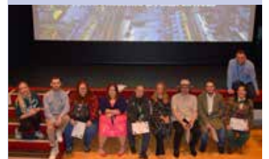
Young people make film about their Blaenau Gwent see page 3